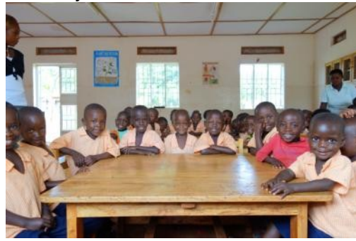
St. Joseph's primary school