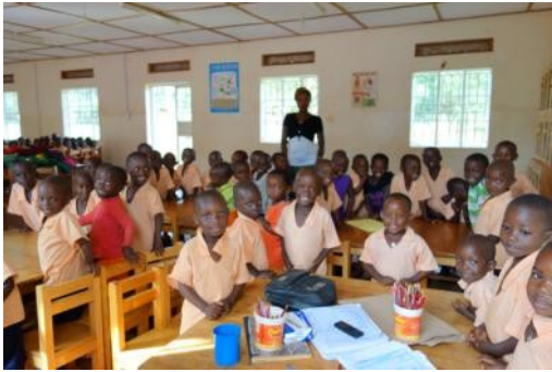
Adelante Africa nursery school

Here are some recent photos of our educational projects: