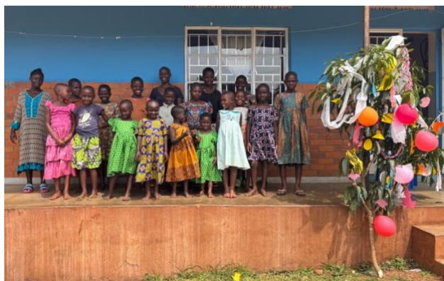
The children from one of the houses with their 2025 Christmas tree

OTCH is doing well, all the staff are co-operative, responsible, and hardworking, especially in taking care of the children. The children are all healthy and happy and learning how to become responsible citizens of Uganda.