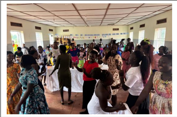
Happy girls at the end of year celebration