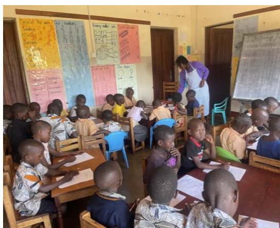
Children in Primary 1 class