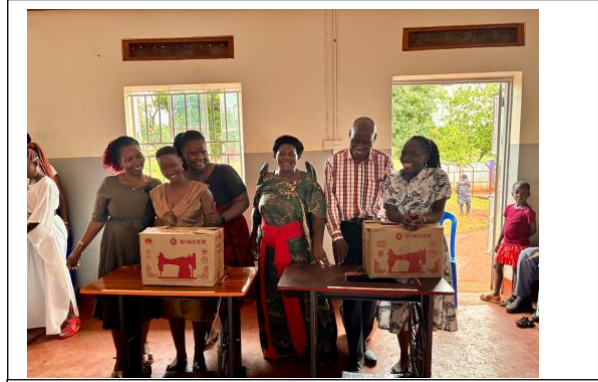
Two of the girls with their sewing machines